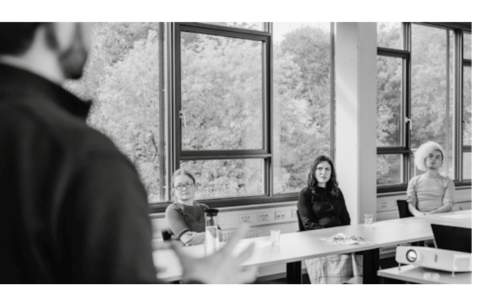
Fellows at the Jour fixe

The University of Konstanz has been successful in the German Excellence Initiative and Excellence Strategy since 2007. The Zukunftskolleg is a keystone in the University of Konstanz's institutional policy to promote top-level research and is funded by the German federal and state governments' Excellence Strategy.