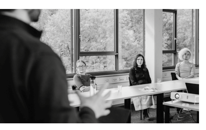
Fellows at the Jour fixe

The University of Konstanz has been successful in the German Excellence Initiative and Excellence Strategy since 2007. The Zukunftskolleg is a keystone in the University of Konstanz's institutional policy to promote top-level research and is funded by the German federal and state governments' Excellence Strategy.