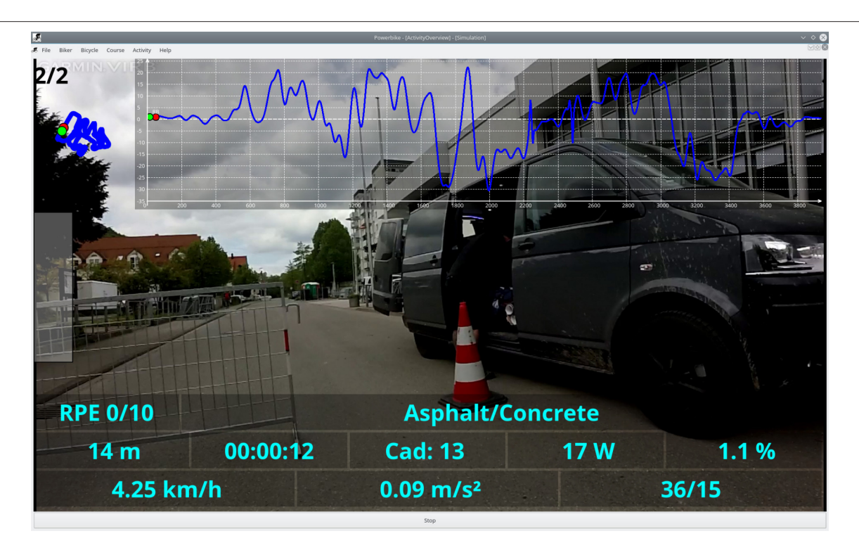
FIGURE 4 | Screenshot from a Powerbike simulation of a ride on a real-world track. The playback speed of a video recorded on the track is controlled by the pedaling speed and the ergometer brake force simulates the incline of the track. The software enables the acquisition of various cycling performance parameters like cadence, pedaling power, cycling speed, acceleration, and distribution of the power over the pedaling cycle. The blue curves in the top represent the map and the slope profile of the simulated track. The Powerbike simulation software could serve as a virtual reality environment for the BrainCycles setup, enabling studies with visual feedback or simulating real-world bicycle navigation in patients with movement disorders.

medication. Custom-made connectors were used to connect the DBS electrodes with the EEG amplifier.