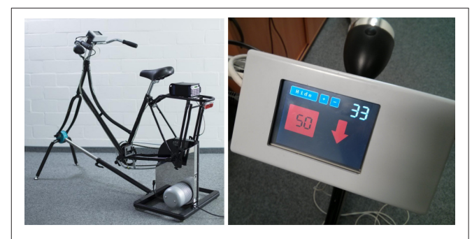
FIGURE 1 | The BrainCycles experimental setup. (Left) Classic Dutch frame and EEG amplifier mounted on the Cyclus2 ergometer. (Right) Handlebar display presenting information about the current and the desired target cadence in rpm.

An Arduino Due board (Arduino LLC, USA) controls the sensors that assess the crank phase angle and a TFT-display mounted on the handlebar. The Due board includes an Atmel SAM3X8E ARM Cortex-M3 microcontroller and features 54 digital input/output pins, 12 analog inputs, 4 hardware serial ports, an 84 MHz clock and 2 digital-to-analog converters (DACs). A vast number of extension boards (shields) and libraries for interfacing to a wide range of hardware is available