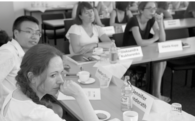
Fellows at the Jour fixe

The University of Konstanz has been successful in the German Excellence Initiative and Excellence Strategy since 2007. The Zukunftskolleg is a keystone in the University of Konstanz's institutional policy to promote top-level research and is funded by the German federal and state governments' Excellence Strategy.