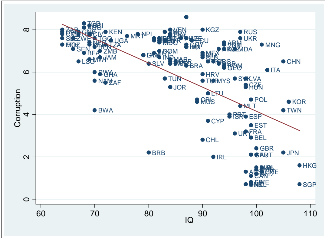
Figure 2: Corruption (2010) and IQ (2006).